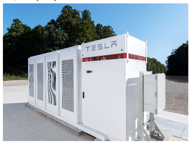
* Shiroi DCC uses utility services provided by Kanden Energy Solution Co., Inc.

IIJ will continue to actively implement the latest technologies while also pursuing and transforming new data center business models.